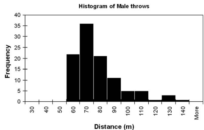
Fig. 4. Histogram showing distance for male slingers.

In the present study, the maximum distance recorded, 130 m, is 28 m farther than the farthest throw from the aforementioned sling study (Finney, 2006:100). Comparing the measurements of novice sling casts from the prior study to our results, we find that the mean distance of the novice male caster ( \bar{x} = 56 m, s = 13 m, n = 90 ) is only slightly above that for experienced female slingers, and more than twenty meters shy of the mean distance for male slingers. Nearly half of the casts from the present sample (48%, n = 68 ) exceeded the hypothesized maximum horizontal distance (66 m) of the earlier study (Finney, 2006:111). In the present sample, the maximum horizontal distance cast by an experienced