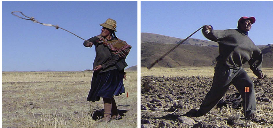
Fig. 1. Photograph showing female slinger (left) and male slinger (right). Casts by the male slinger achieved the greatest distances.

The maximum distance of any throw in the sample was noted. Means and standard deviations were calculated for the pooled sample, for throwers grouped by sex, and for throwers grouped by