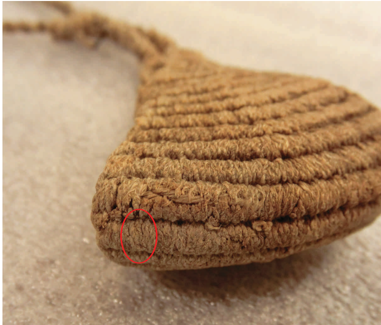
Figure 8: Close-up of the lower side of the pouch. The focus is on row 18, which is damaged. Marked in red is one occasion of an S-twisted thread in row 17. The weft is visible in row 18.