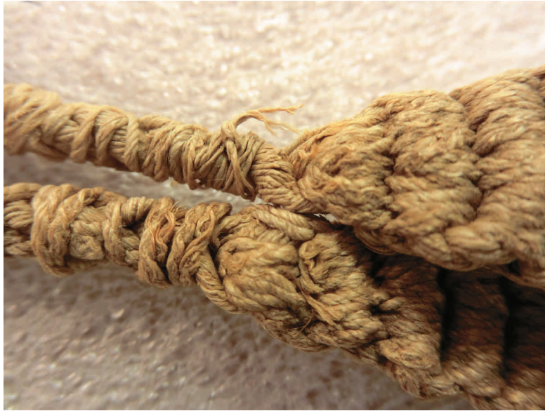
Figure 15: Close-up of the transition from retention and release cord to the pouch. The upper cord is the release cord.