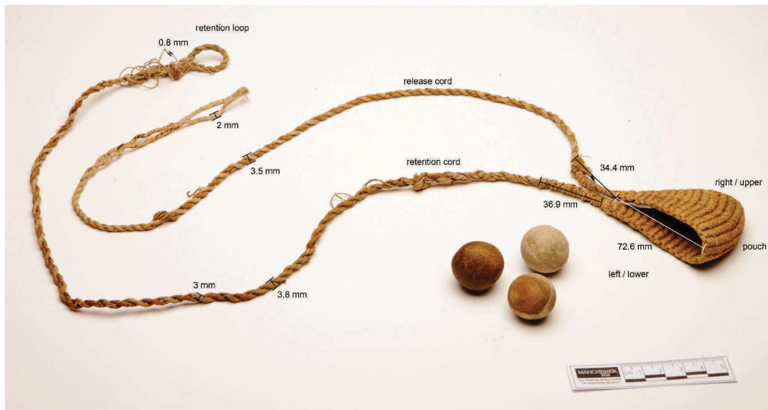
Figure 1: Full view of the specimen with the measured distances. It is possible that the three balls shown together with the sling are not slingstones as they are rather small (Image courtesy of Manchester Museum, University of Manchester, labels added).

The labeling of the sling as well as the respective measurements can be seen in Figs. 1 and 2. The sling has a retention cord with retention loop. The release cord is also present, although slightly damaged. To point out certain positions in the pouch the terms left/right as well as upper/lower half of the pouch will be used as designated in Fig. 1. Additionally, the corresponding row number as labeled in Fig. 2 will be given when necessary. The measurements were made with a caliper and measuring tape. While measuring, the sling was never pinched. Therefore especially the diameters of the strings as well as given thicknesses must be be regarded as upper limits. Unfortunately, I forgot to measure the exact length of the release and retention cord. I estimate the distance from the end of the pouch to the retention loop to about 55 cm. The threads going in longitudinal direction along the pouch will be referred to as warps, the threads or strings going from left to right across the pouch will be referred to as wefts. I want to stress that by calling these threads warps and wefts I do not intend to make any implications about how and with which technique the pouch was made. Their function may easily have been inversed during manufacturing.