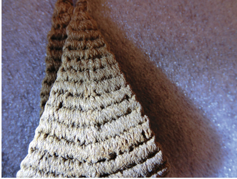
Figure 14: Close-up of the upper side of the pouch. A "V-shape" of the rows is visible.