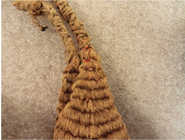
Figure 6: Close-up of the lower side of the pouch. Visible are rows 34 through 26. Marked in red is one occasion of an S-twisted thread in row 34.