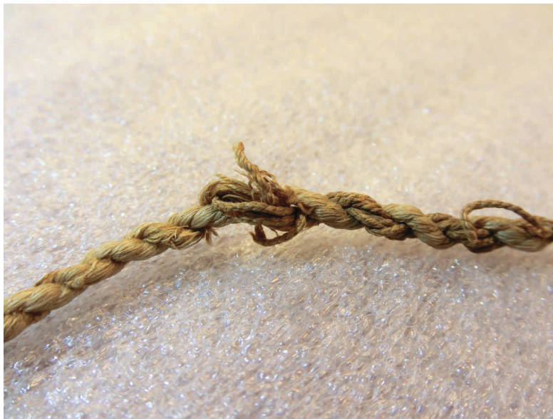
Figure 4: Close-up of the release cord. A transition to a different material is visible. In the brighter material, possibly raw plant fibre, no thinner threads can be easily identified. The dark material consist of S-twisted thin threads.