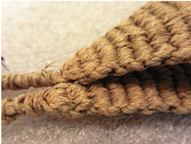
Figure 9: Close-up of the left side of the pouch. Rows 1 through 7 are on top. The twist of the weft can be most easily seen between row 2 and 3.