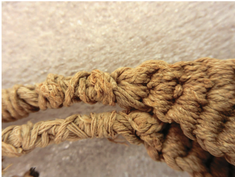
Figure 16: Close-up of the transition from retention and release cord to the pouch. The upper cord is the retention cord.