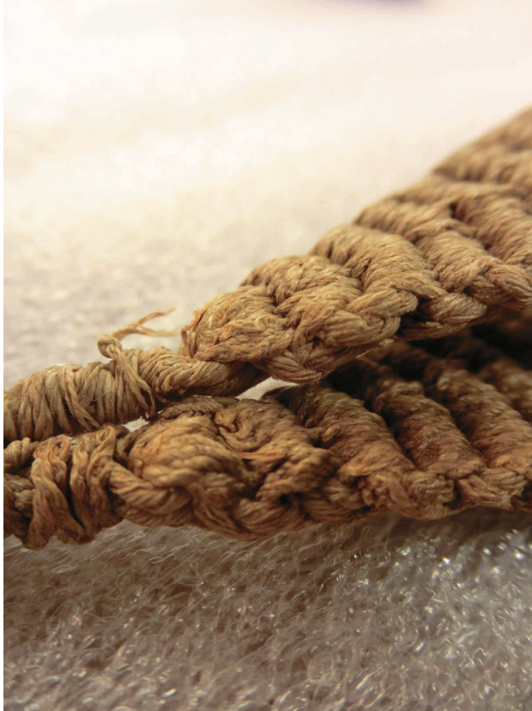
Figure 17: Close-up of the transition from retention and release cord to the pouch. The upper cord is the release cord.