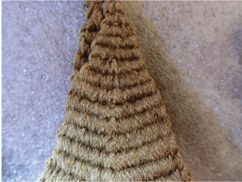
Figure 12: Close-up of the lower side of the pouch. The warps bulge out significantly in the left of the image, which corresponds to the right side of the pouch.