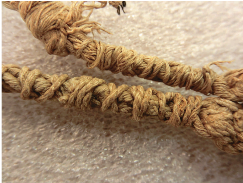
Figure 5: Close-up of the transition from retention and release cord to the pouch. The top cord is the release cord, which is wrapped with Z-twisted thread, the bottom cord is the retention cord, which is wrapped with S-twisted thread consisting of two Z-twisted plies.

The wrappings at the transition pouch-release/retention cord consist of thread with a similar diameter as the thinner thread in the retention/release cord. They are partially made with 2 ply and S-twist threads, partially with Z-twisted threads. It is rather intriguing that the wrappings of the cords are made with threads of the opposing twist than used in the cords themselves.