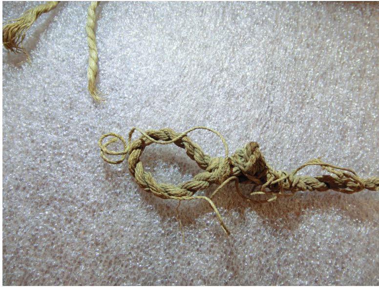
Figure 3: Close-up of the retention loop. On top the frayed end of the release cord is visible. On the bottom of the retention loop a frayed thinner Z-twisted thread is visible, where 3 plies with S twist can be seen.