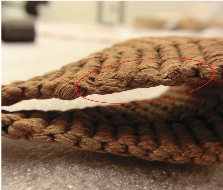
Figure 10: Close-up of the right side of the pouch. The weft is broken around row 25, marked by a red circle. The two outermost threads are 2 ply and S twisted, the individual plies are Z-twisted. It is visible that the two outermost warps twine around each other.

The warps of the pouch seem to be, at least partially, twined. See Fig. 10 where the right side of the pouch is shown. There, a part of the weft is missing and the warps are visible. Clearly, a Z-twining of the warps around each other can be seen. This twining of the warps is most probably also present on the opposing edge of the pouch, but more difficult to identify (see e.g. Fig. 11). Left and right border seem both to be Z-twined. For me it was impossible to tell whether the warps are also twined in the middle of the pouch due to the high density of the warps. For a reconstruction I would assume that the warps are all twined. This assumption is justified as a transition from twining to a plain weave would produce one cross where two warps from the front side would lay adjacent to each other without being separated by a warp from the backside. I could not find such a position. However, I could also simply have overlooked this tiny feature in this very dense piece. The assumption of twined warps is further supported by the observation that the ends of the pouch do not lie on top of each other; the upper end of the pouch is offset to the right. This indicates that the piece has a tendency to twist, which can be caused by the twining of the warps. In several reconstruction attempts I encountered this feature as well, the side depending on whether the warps were S- or Z-twined. Z-twining leads to an offset to the right, fully consistent with what is observed