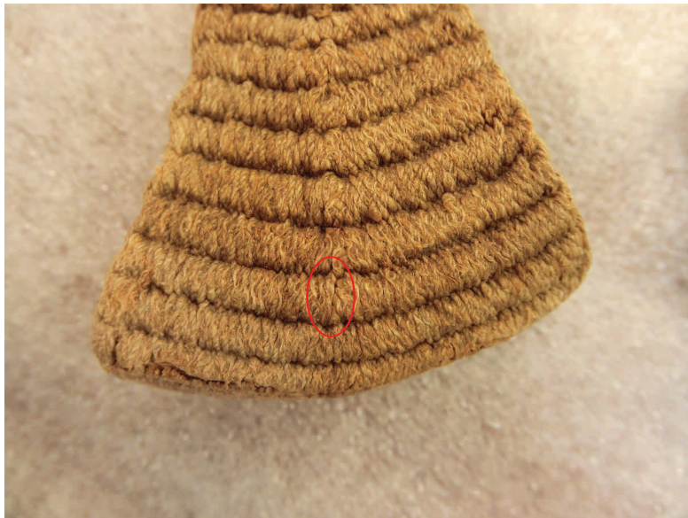
Figure 7: Close-up of the lower side of the pouch. Visible are rows 26 through 18 (damaged part). Marked in red is one occasion of an S-twisted thread in row 20.