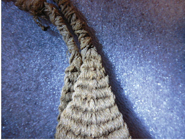
Figure 11: Close-up of the lower side of the pouch. Rows 34 through 25 are visible. The left side of the pouch, as labeled in Fig. 1, is on the right.